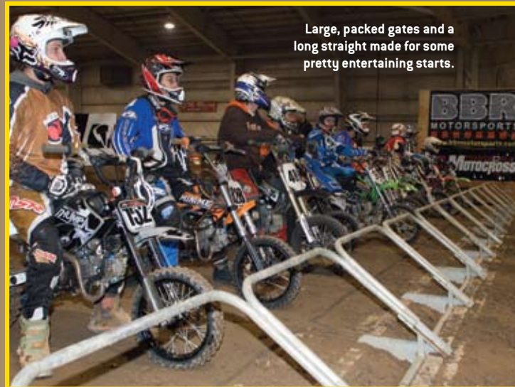
Large, packed gates and a long straight made for some pretty entertaining starts.

For the series finale, the MoM and Mototown crew created what has to be one of the largest pitbike tracks we have ever seen. Packed with banked corners, bike-eating whoops, long straights and a perfect combination of large, medium and small jumps, the Mototown track was well received by the hundreds of riders and spectators in attendance. Thanks to a huge gate, there was no need to double-stack riders on the starting line even though the classes were packed, and as expected, the racing was off the hook. Throughout the day, the long and fast track did