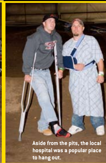
Aside from the pits, the local hospital was a popular place to hang out.