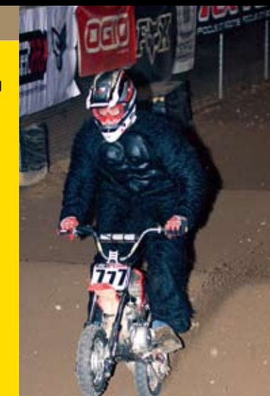
This is actual proof that you can teach a gorilla to wheelie a pitbike.