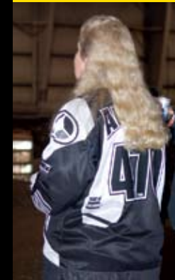
Just your typical die-hard TransWorld supporter!