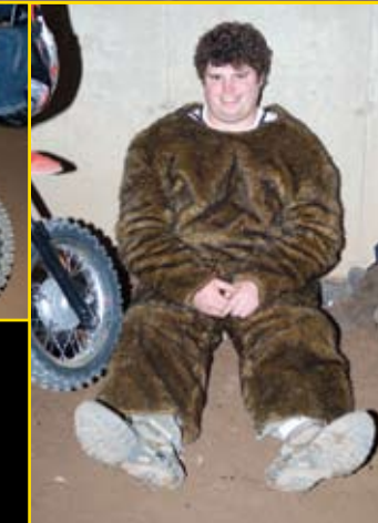
Fox's new line of winter gear is . . . um . . . weird.